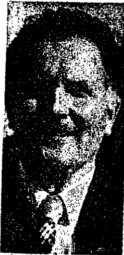
Jensen and a study cited in his book: Bound to renew the debate over genes and intelligence

charges, publishing an encyclopedic review of testing—a book that promises to stir still another stormy debate over racial intelligence and the value of tests.